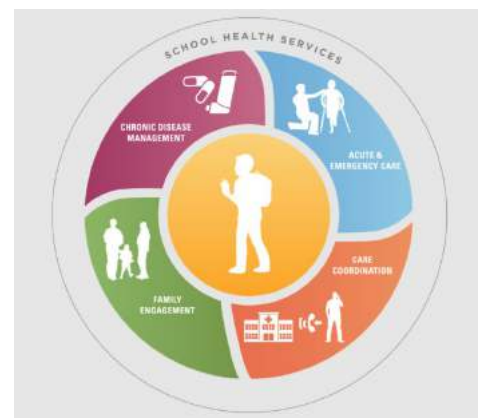
Figure 1. School Health Services Model (CDC)

The COVID-19 pandemic has amplified this stark reality and also brought into sharp focus the important role schools have in ensuring children and adolescents are healthy enough to learn. As more children head back to physical school buildings, school-based health centers (SBHC) will be on the front line of keeping children safe in the classroom and ready to learn. SBHCs are medical health centers within schools that can provide comprehensive healthcare, physicals, health education, health screenings, immunizations, and first aid. They can also treat acute and chronic health problems like asthma, lowering the chance of an emergency room or hospital visit. Studies have shown that having a SBHC located in a school lowers school absences and helps prevent parents from missing work. Many SBHCs in underserved areas also offer services to the surrounding community and , may also provide mental health services, dental care, and vision services.